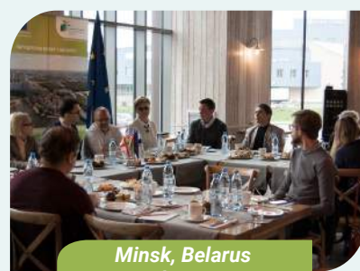
Minsk, Belarus September 21, 2017

Media representatives increased their understanding of the new Covenant of Mayors, and learned about the CoM East Project and its implementation in Armenia, Georgia and Belarus. The acquired knowledge they will further use in their professional activity.