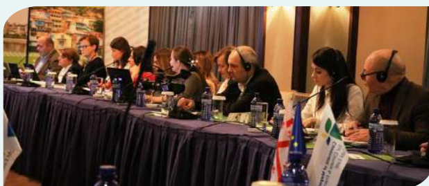
Media Workshop in Tbilisi (November 27-29, 2017)

On the basis of 85 entries submitted for the contest, 48 journalists (23 from Armenia, Azerbaijan, Belarus, Georgia and Moldova and 25 from Ukraine) were selected to take part in the CoM East media trainings. Awarded media materials have been posted on the CoM East Facebook page.