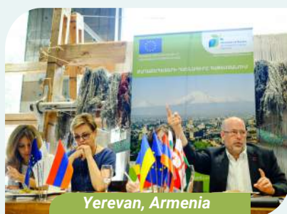
Yerevan, Armenia September 12, 2017

A series of informal meetings with national, regional and local media of the Eastern Partnership countries in the format of media breakfasts was held by the CoM East Project in autumn 2017 to promote the new Covenant, its targets and benefits, as well as the CoM East achievements and planned activities in the region. The CoM East Project Team provided the journalists with general overview of the CoM EU initiative, new targets for the EaP countries, why CoM East project comes to EaP region, how the CoM East is being implemented in specific EaP Country, what benefits it brings to their residents etc.