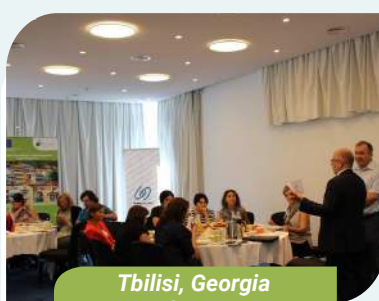
Tbilisi, Georgia September 13, 2017