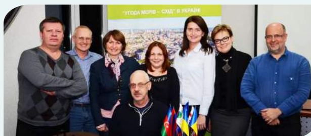
CoM East Team at Media Workshop in Myrhorod (December 6-7, 2017)

Covenant of Mayors East Facebook page is an effective information tool to promote the CoM East developments, share success stories and best practices implemented in the EaP countries, as well as to keep the audience timely informed about the project's news and achievements.